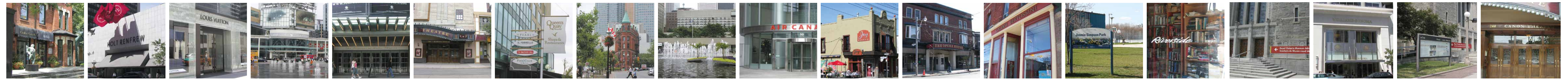
96"W x 48"H (this is at 50% of actual size)

Corktown is the epitome of city living, nestled in a central urban location, with the best amenities all around. Neighbourhood shops, restaurants and pubs are just steps from your door, while the rest of the city's best attractions are just minutes away by public transit. The Queen streetcar is virtually at your door, and so is access to the DVP for destinations near and far.